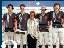
A quick recap of the 2019 End of Spring Season