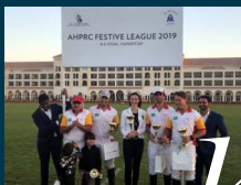
New winners of the AHPRC Festive League