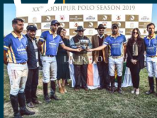
The finals of the HH Maharaja of Jodhpur Cup