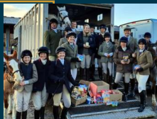
The perfect Christmas gift for the horse riders