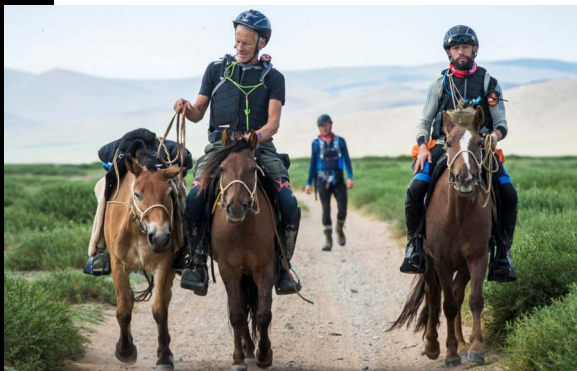
Participants at the Mongol Derby