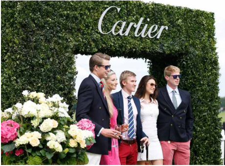
Polo enthusiasts getting photographed