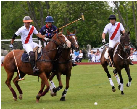
Polo at Newport Polo Club before the pandemic hit the world