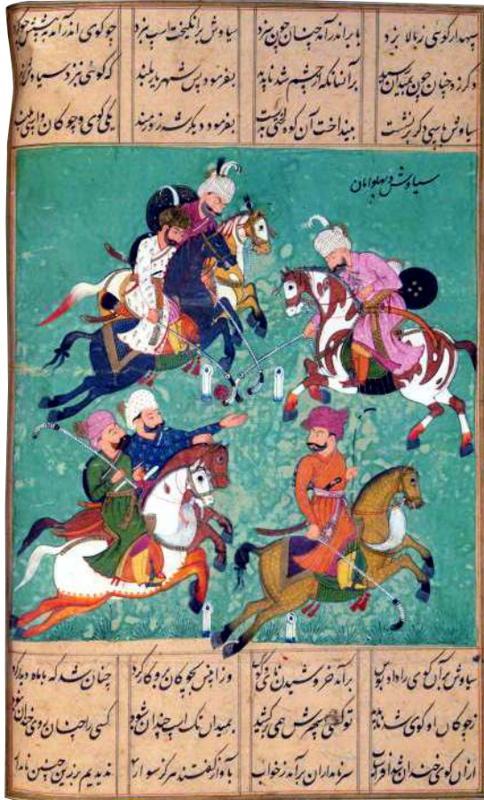
Image credit: Spencer Collection, The New York Public Library. "Siyāvush plays polo (chaugān) before Afrāsiyāb." The New York Public Library Digital Collections. 1720–1725.