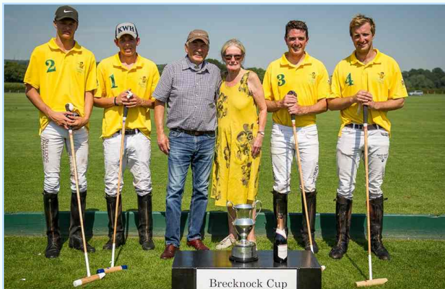
Team Maiz Dulce with the Brecknock Cup