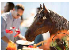
Clinique La Prairie celebrates the victory