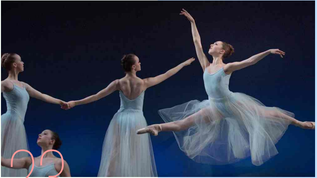
The affair of the ballet shoes

Image: University of North Carolina School of the Arts