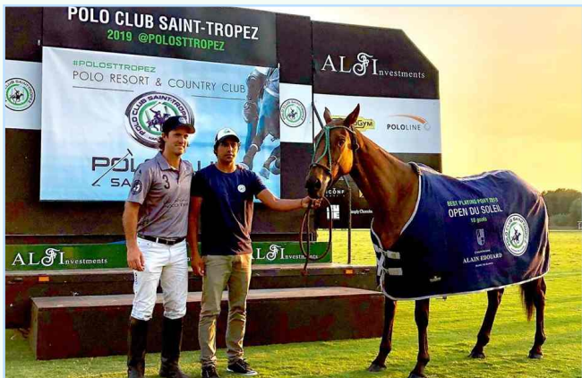
Best Playing Pony: OPEN KINI