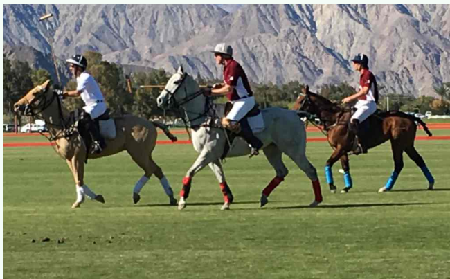
The beautiful landscape view of Eldorado Polo Club