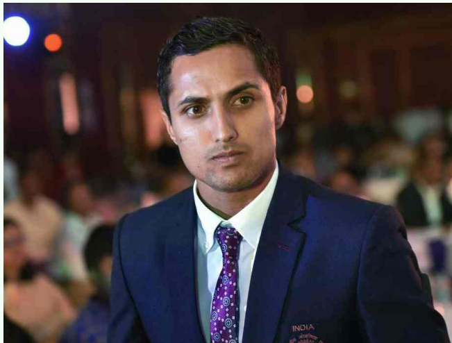
Asian Games Silver Medalist - Fouaad Mirza

"My main focus is the selection for the 2020 Tokyo Olympics right now. It's within our grasp but it also depends on the horses." Fouaad told PTI from Germany.