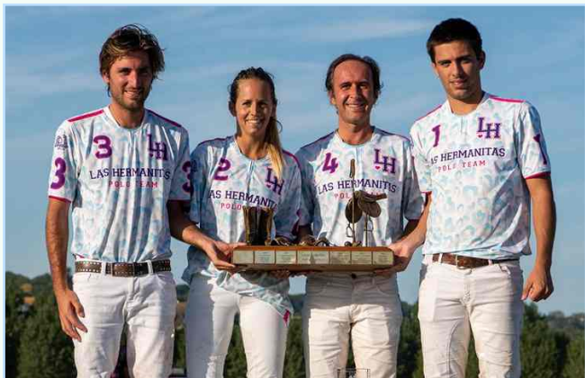
Las Hermanitas with the Bronze Cup