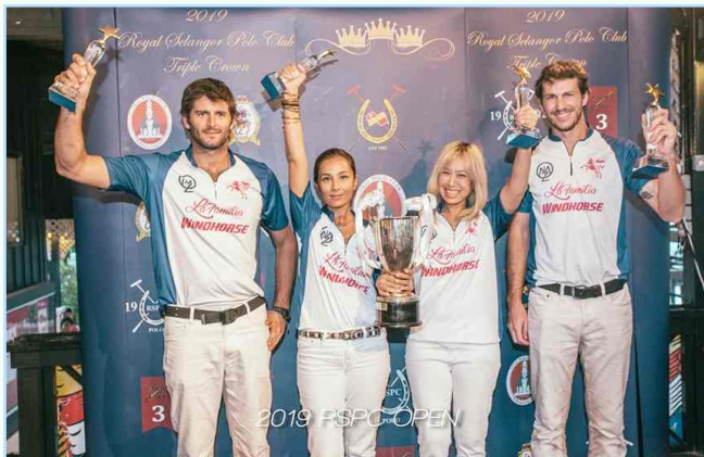
La Familia Windhorse celebrate the win