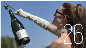
Sabre A Champagne