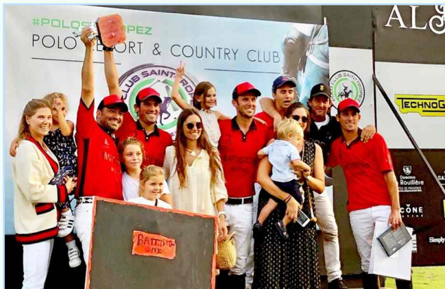
Team Battistoni celebrates the title