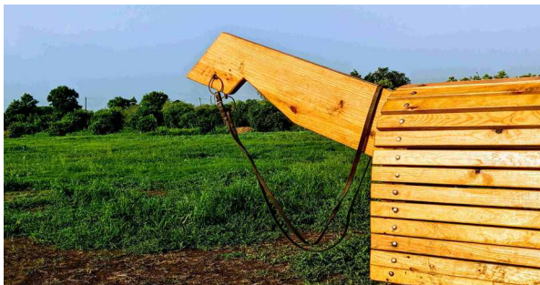
Polo on countryside: Gohilwad Polo Club

C aptured with an essence of mysteriousness and detailing in the ethos of the preserved history of the state of Lion, is the sport played on horseback. One of the oldest team sports, Polo has had a major play in the princely state of Gujarat with a vast and rich history associated with it.