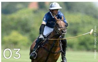
A great fight between Conosco and Twelve oaks for Hildon Archie David Cup