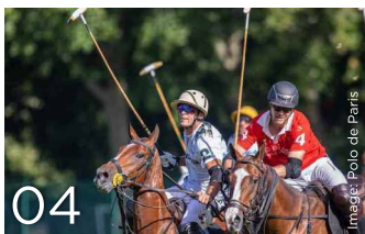
The Finals of 125° Open de Paris