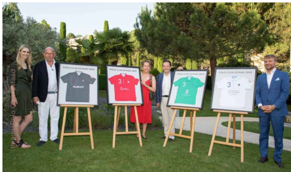
The announcement of the teams