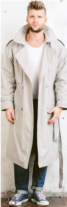
20 Raglan Sleeves and it's enriched history