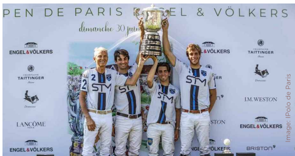
Team Sainte Mesme with the 125° Open de Paris Engel & Volkers cup