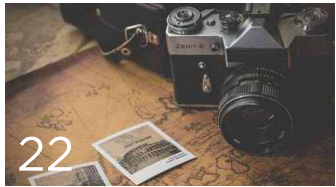
22 The tale of the first camera that the world saw