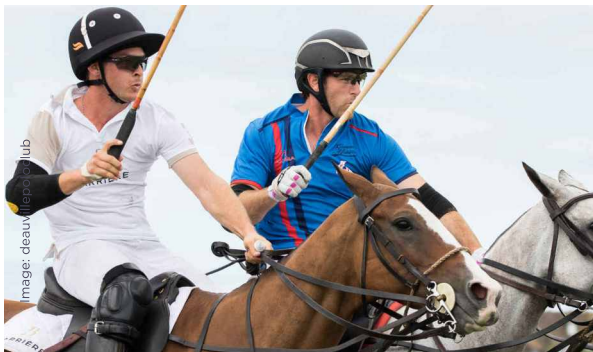
A highlight of Deauville International Polo Club from 2018