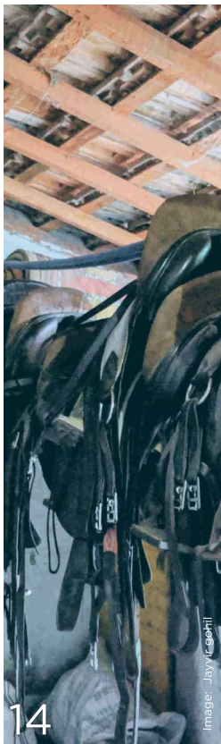
Polo on the Countryside