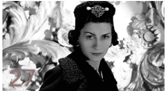
27 Coco Chanel- The celebrated fashion designer