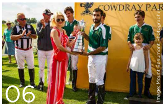
The battle for the Midhurst Town Cup