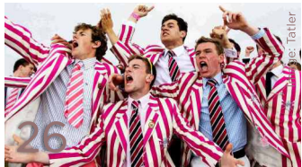
26 Henley Royal Regatta- The best regatta in the world