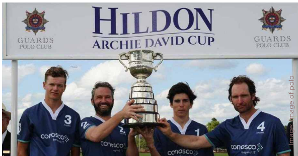
Team Conosco with the Hildon Archie David Cup