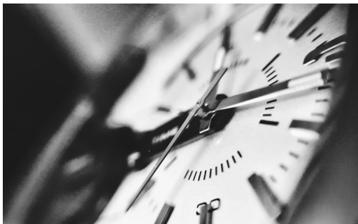
Women's watch and the story of its origin

THE HISTORY OF WATCHES IS HARD TO FIND, BUT THE STATIC BEGINNING COULD BE TRACED DOWN TO THE DAYS OF THE 1880'S.