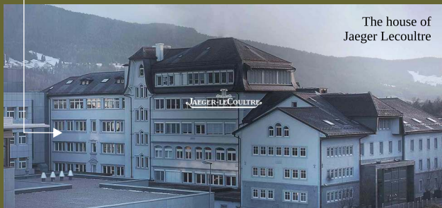
The house of Jaeger Lecoultre

Jaeger-LeCoultre's gift of Reverso to polo has been one of the most endearing stories of the sport. The story goes back to the 1930s, when the watch was born of a challenge, that of designing a model that could withstand the polo matches of the British Army officers in India. Its dial is smoothly concealed by reversing the case, to reveal a back that fully protects the face from possible mallet strokes.