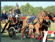
Polo in Patiala with The Western Command Polo Challenge