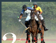
Finals of the DGST Trophy 2019