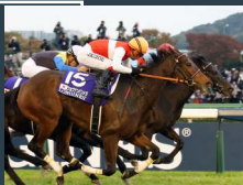
Japan Cup in action