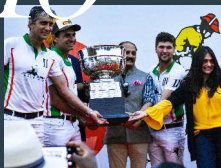
Finals of the IPA National Polo Championship Open