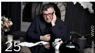
Alber Elbaz on fashion and style