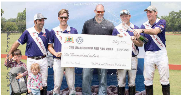
The winners of Southwestern Circuit Officer's Cup: ML Bar Ranch