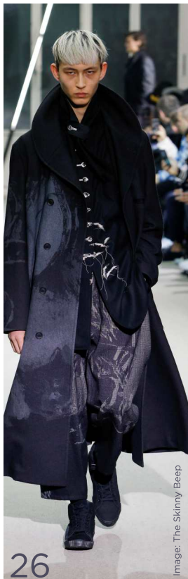
Paris men's fashion week