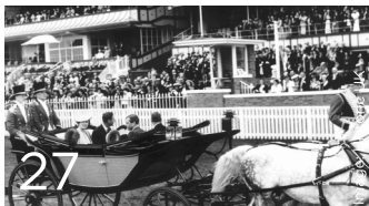
Royal Ascot then and now