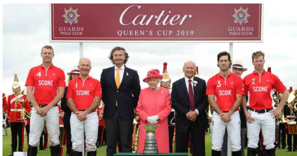
Team Scone Polo with the Queen's Cup