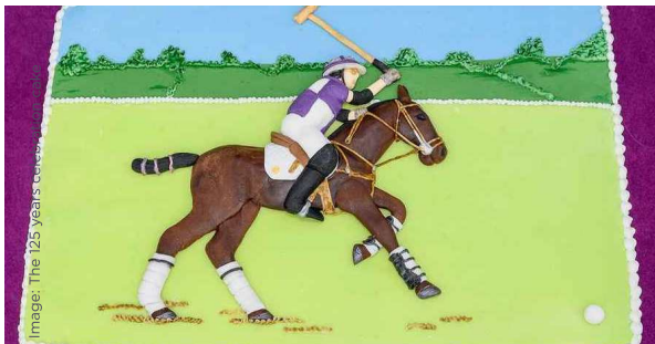
Cirencester Park Polo Club