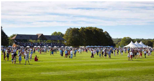
The crowded Greenwich Polo Club