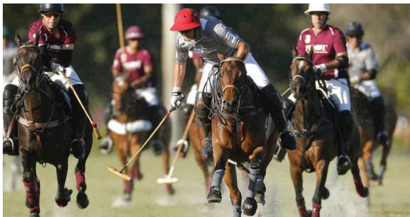
Highlights from the previous year