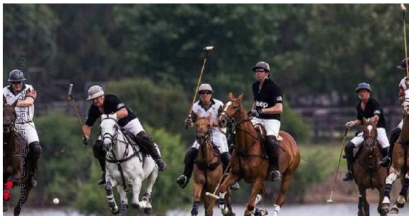
Highlights from the Warwickshire Cup