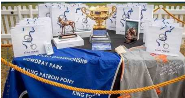
The King Power Gold Cup