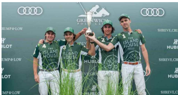
Greenwich Polo Club