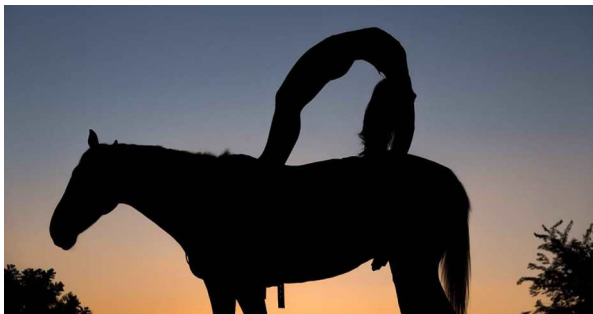
Yoga with horses

This is the soul, spirit, or divine self – we relate to your understanding of the spiritual, eternal aspect of living beings. It believes to the fact that the essence within us is the same essence that is within the horse. At this level it seems to experience that we are one and the same. This is the truth of who we are. Horse and human are ultimately seeking the same thing – peace; which is why horse yoga is not only spiritual, but an ultimate quest for peace. Known to be called as equestrian yoga it was built in order to guide through improving the bond and connection between two living beings. The practice was originally created to work on core stability, balance and to be present, something a horse is too practiced on.