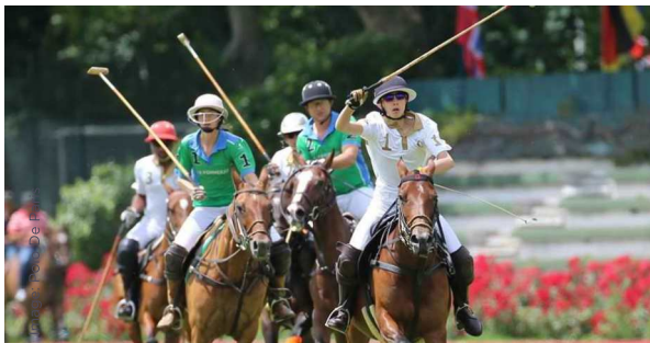
Highlights from the first day of championship