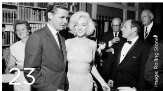
Marilyn Monroe's 'Happy Birthday Mr. President' dress